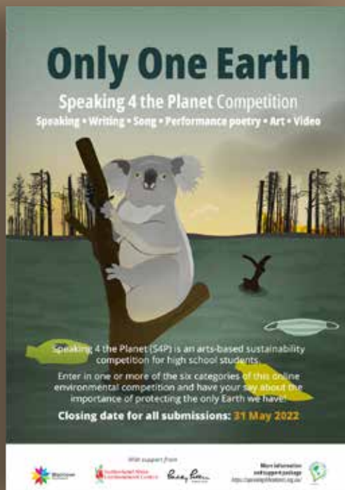
Poster, social media appearance, booklet and website.

In some instances, online sessions on each of the competition categories have been held for students.