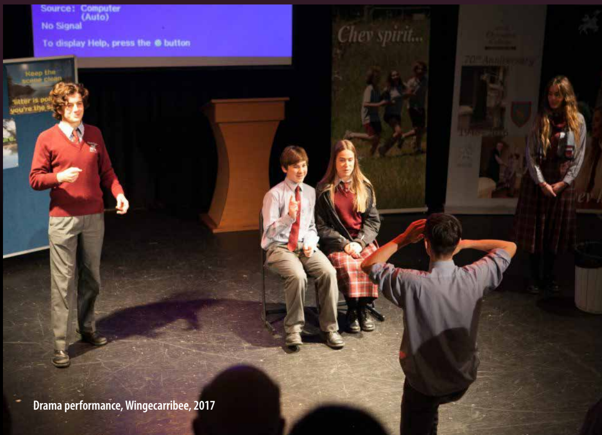
Drama performance, Wingecarribee, 2017

The Kids 4 the Planet competitions have started to include an impromptu, group-based STEM (science, technology, engineering and maths) category.