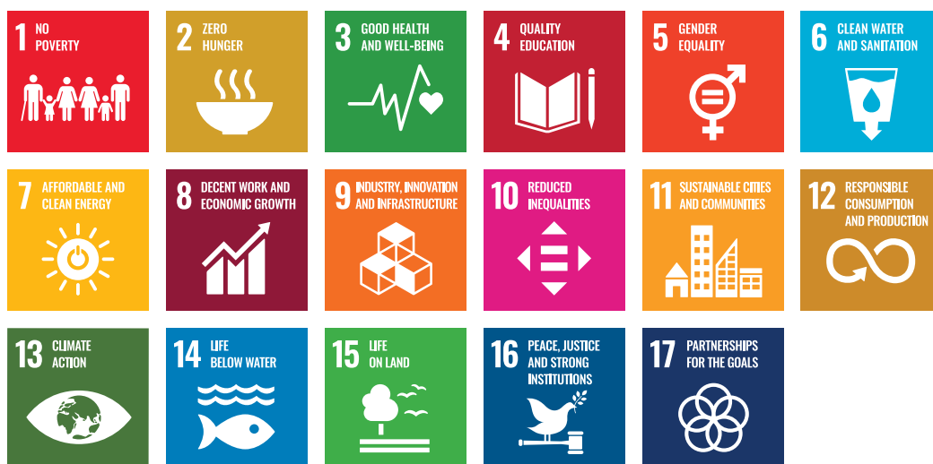
The 17 Sustainable Development Goals (SDGs)